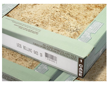
POS packaging for oversized items