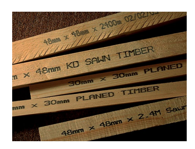
Direct applied to building materials