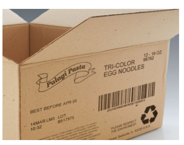
High-resolution text, bar codes and logos on shipping cases